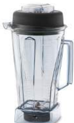
2.0 L Standard Container with Lid and Blade Assembly