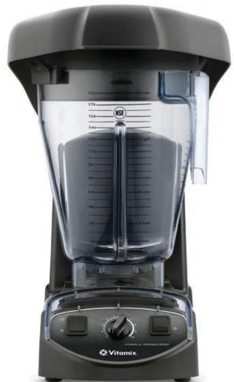
VM57556 with 5.6 Litre XL Container