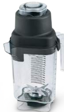
2.0 Litre XL Container