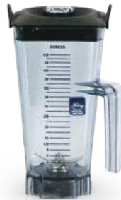
1.4 Litre Ice / Wet Containers