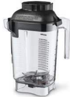
Advance® Container 1.4 Litre