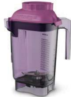
Advance® Purple Container 1.4 Litre