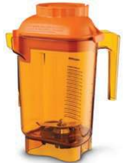
Advance® Orange Container 1.4 Litre