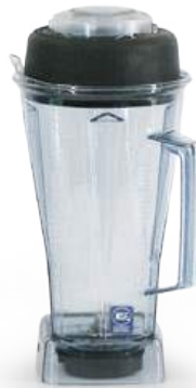
2.0 Litre Container