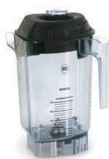
Advance® Container 0.9 Litre

Additionally, double bearings provide more rigidity and ensures the containers remain quiet over their lifetime, unlike other brands of containers with single bearings that become noisy over their lifetime.