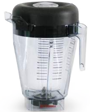
5.6 Litre XL Container