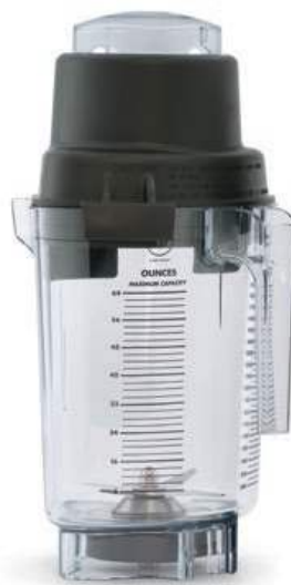
Optional 2.0 Litre XL Container