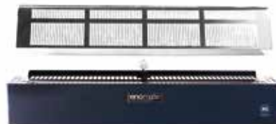
TWO-COLOUR BOTTOM DRAWER KIT