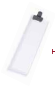
OPERATING METHOD KIT FOR RED WINE ZONE AND WHITE WINE ZONE